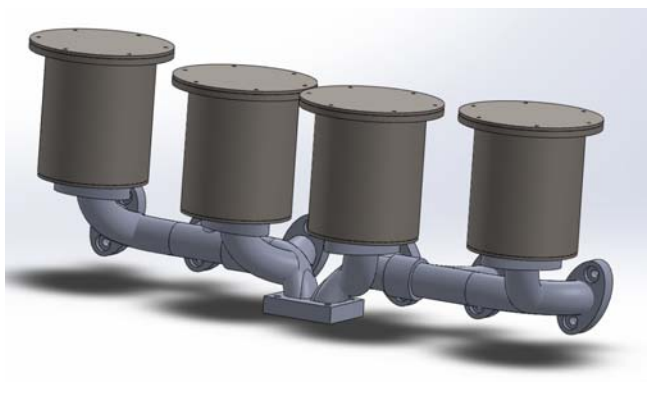
Figure 2. Exhaust manifold with four cylindrical volumes added.

To vary the exhaust pulse shape at the turbine inlet a custom manifold was constructed. The overall manifold volume was varied by adding cylindrical volumes to bends welded to the standard exhaust manifold. During the test campaign different volume configurations were investigated, for example using four volumes or two volumes at various positions. The exhaust manifold was then installed on a Heavy-Duty Scania engine and the effect on turbine efficiency investigated at different operating conditions.